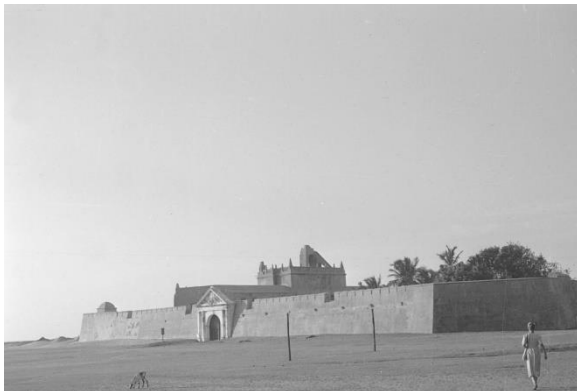
Fort Dansborg seen from the Parade Ground.