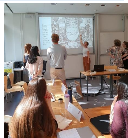
Summer school students discussing Hobbes August 2019