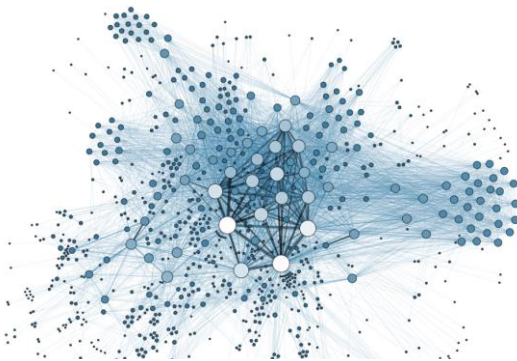
Visualization of a social network using metadata of thousands of archive documents. M. Grandjean (2014). " La connaissance est un réseau ". Les Cahiers du Numérique 10 (3): 37-54. Imaged licensed CC BY-SA 3.0 . Source: Wikimedia Commons.

One of the tenets of the PRIVACY research method is that, in order to examine early modern privacy, researchers might profit from a systematic-yet-multifaceted approach. The method for the analysis of historical privacy can be strategically subdivided in three complementary approaches to primary sources. The first approach focuses on terminologies of privacy , and seeks to unveil the different discursive inflections used throughout history to express experiences and norms around privacy. The second approach focuses on zones of privacy , and proposes a heuristic strategy to examine the social and spatial organization of practices related to privacy. The third approach focuses on mapping the semantics of privacy , zooming in, for instance, on its opposites in order to uncover what can be learned by ana-